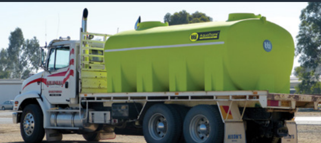
Water Cartage Tanks / Units

Manufacturer of “ The Safest Tanks in Motion ”