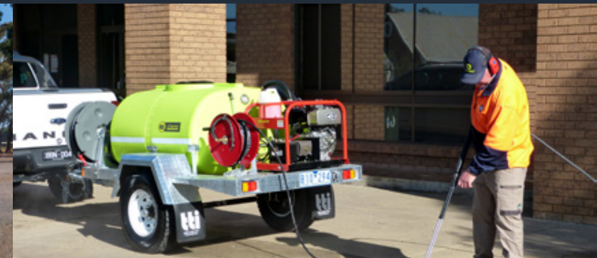
Pressure Cleaning Equipment