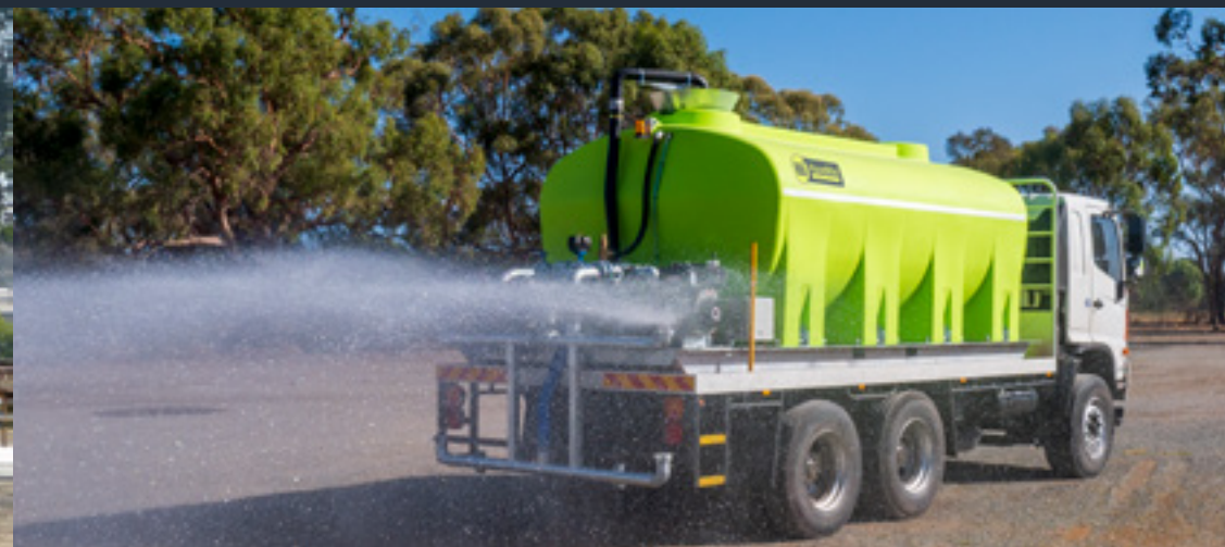
Industrial Water Carts