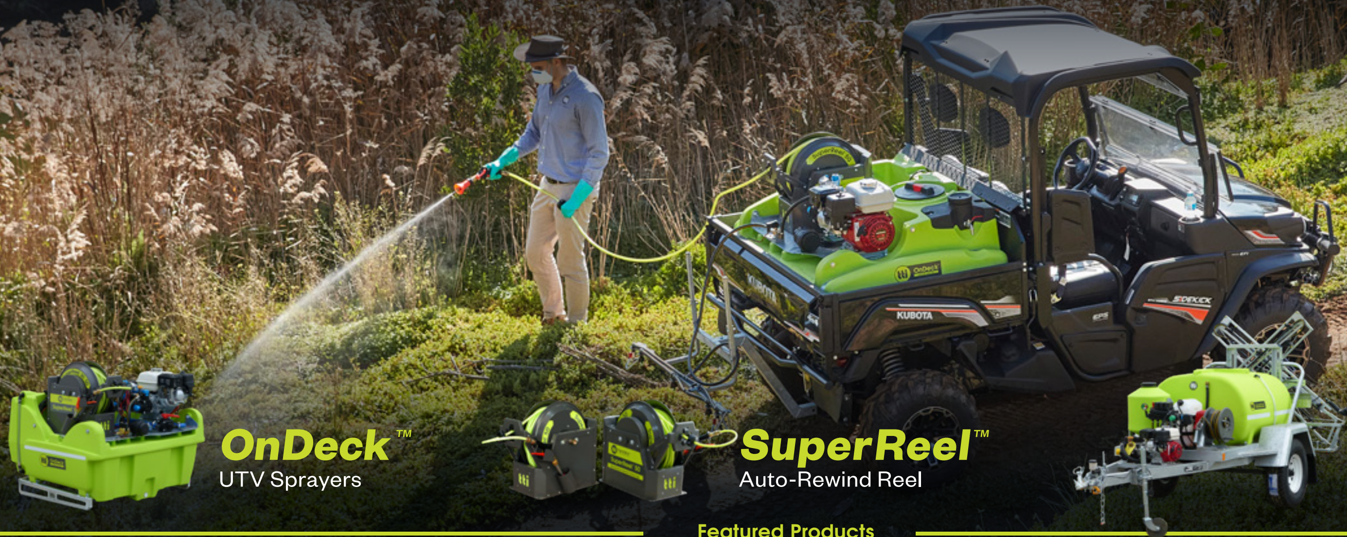
OnDeck™ UTV Sprayers